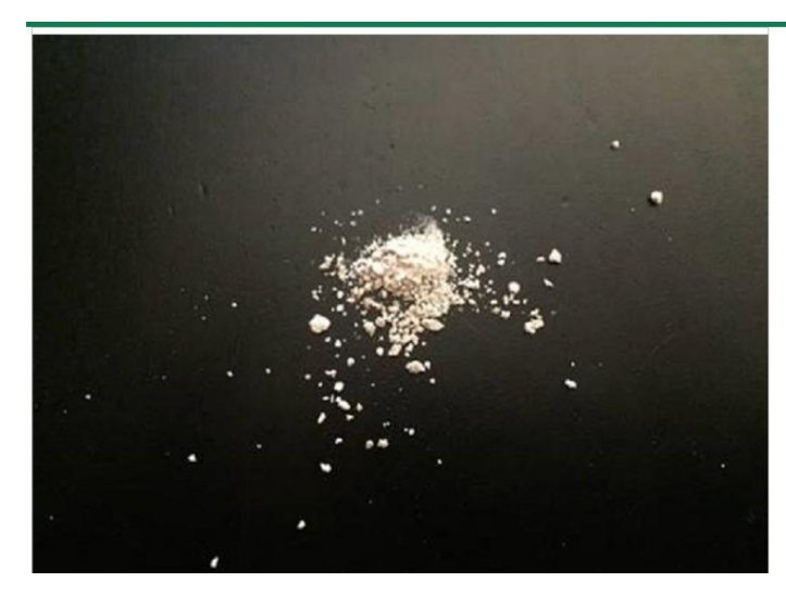
Phosphatic uroliths, goat 2/3 Phosphatic uroliths from a goat.