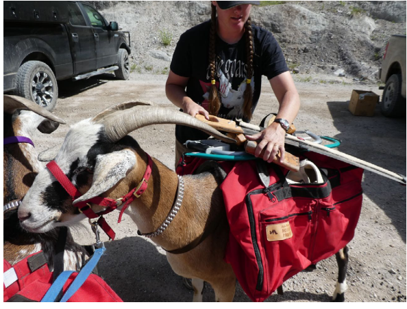
Work project on the Alpine Gulch Trail, including rerouting water, rebuilding trail with rock, and building bridges over the swollen creek