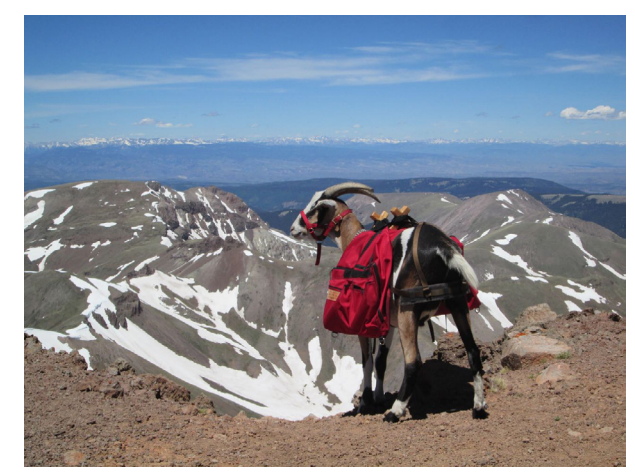
Climb up Uncompahgre Peak, elevation 14,321 feet