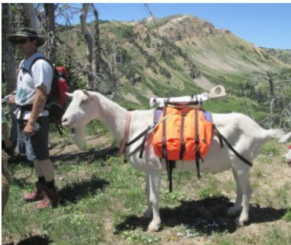
A goat anxious to come to the Rendy!

If you are interested in hosting a Rendezvous yourself, please read the Guidelines to see if this is something you could do.