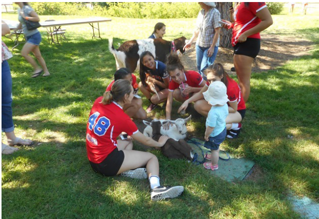
Soccer girls lovin on Hershey and Harley